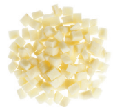
3/4" Peeled and Diced Potatoes