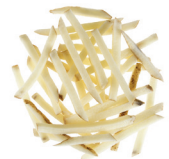
3/8" Potato Sticks with Skin On 2 Ends