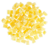
1" Diced Yukon Potatoes