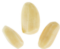
Peeled Potatoes in Water