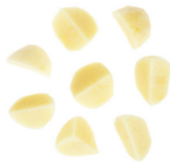
Peeled and Quartered Yukon A Potatoes