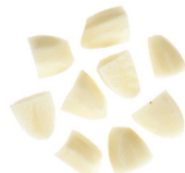
Peeled and Quartered Potatoes