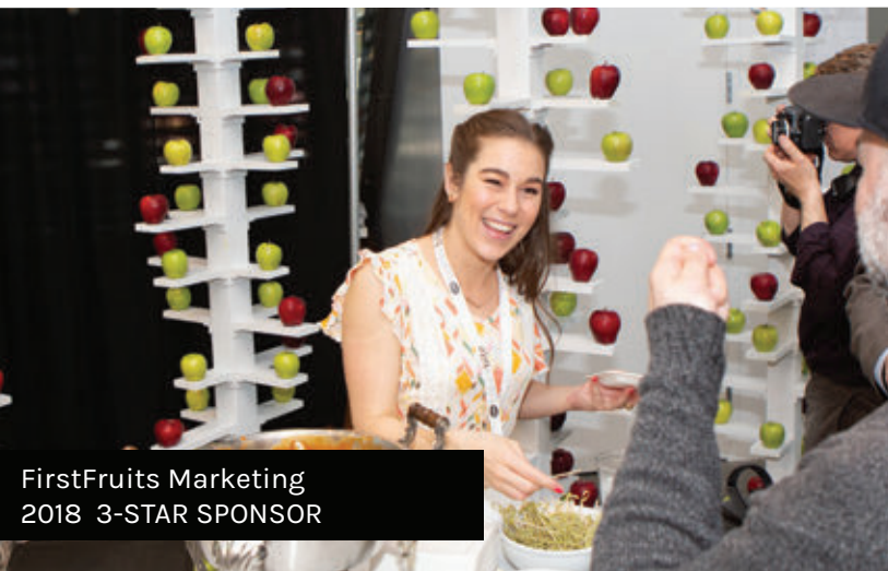
FirstFruits Marketing 2018 3-STAR SPONSOR