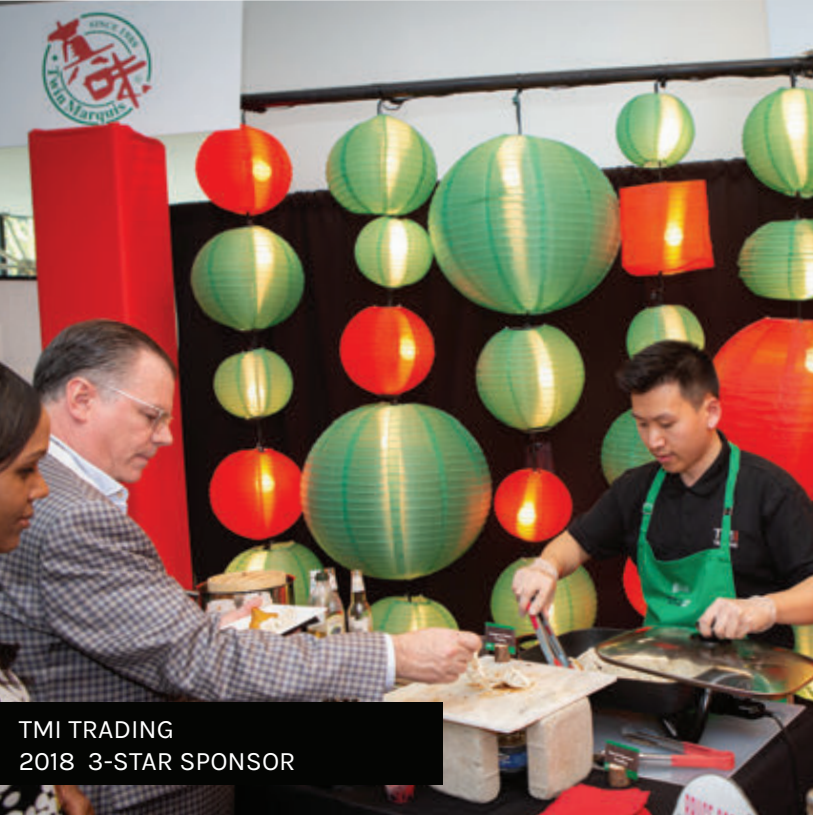
TMI TRADING 2018 3-STAR SPONSOR